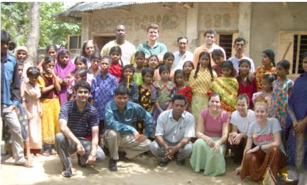
The 2004 group at the BRAC informal school.