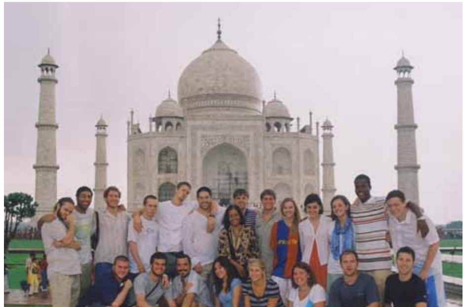
The 2008 group at the Taj Mahal in Agra.

ECON 347: Microfinance Institutions in South Asia. The course would provide an overview of the microfinance industry: its origins, evolution, theoretical underpinnings, and empirical evidence. It would focus on both the tools of microfinance operation such as financial management and lending methodologies, and on the basic issues and policy debates in microfinance, such as impact assessment, poverty targeting and measurement, and sustainability.