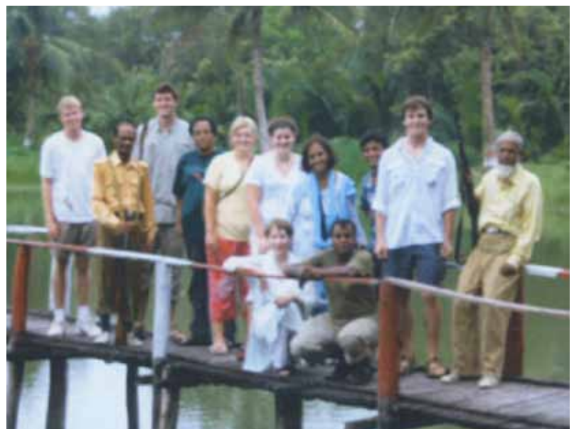
The 2009 group at the Sundurban Forest in Bangladesh.