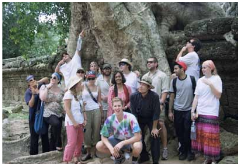
The 2010 group in Cambodia.