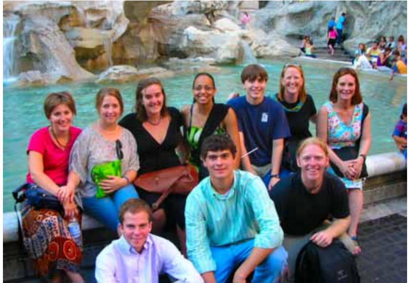
The 2005 group in Italy.