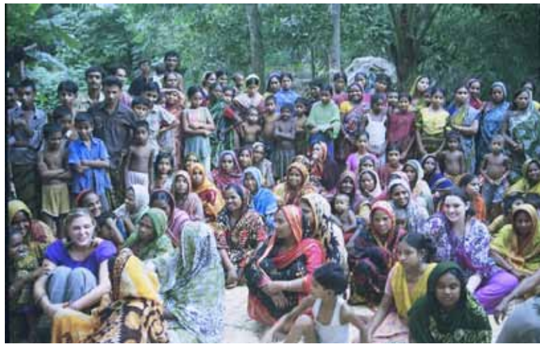
Students with BRAC borrowers and their children in 2010.