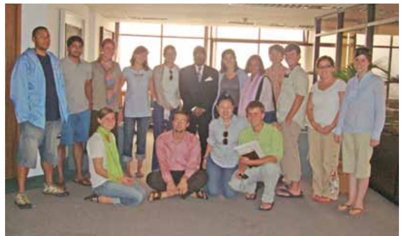
The 2007 group with Sir Fazle Hasan Abed of BRAC.