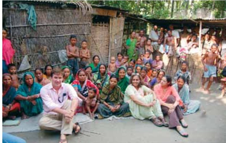
The 2006 group with Grameen borrowers.