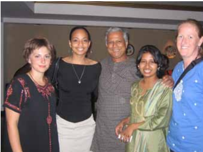
Professor Muhammad Yunus, winner of the 2006 Nobel Peace Prize with the 2005 Sewanee group.